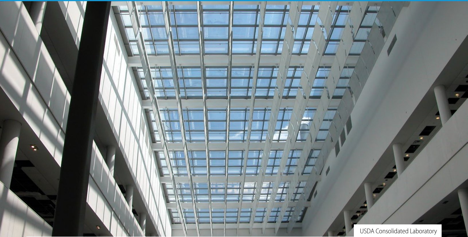
USDA Consolidated Laboratory