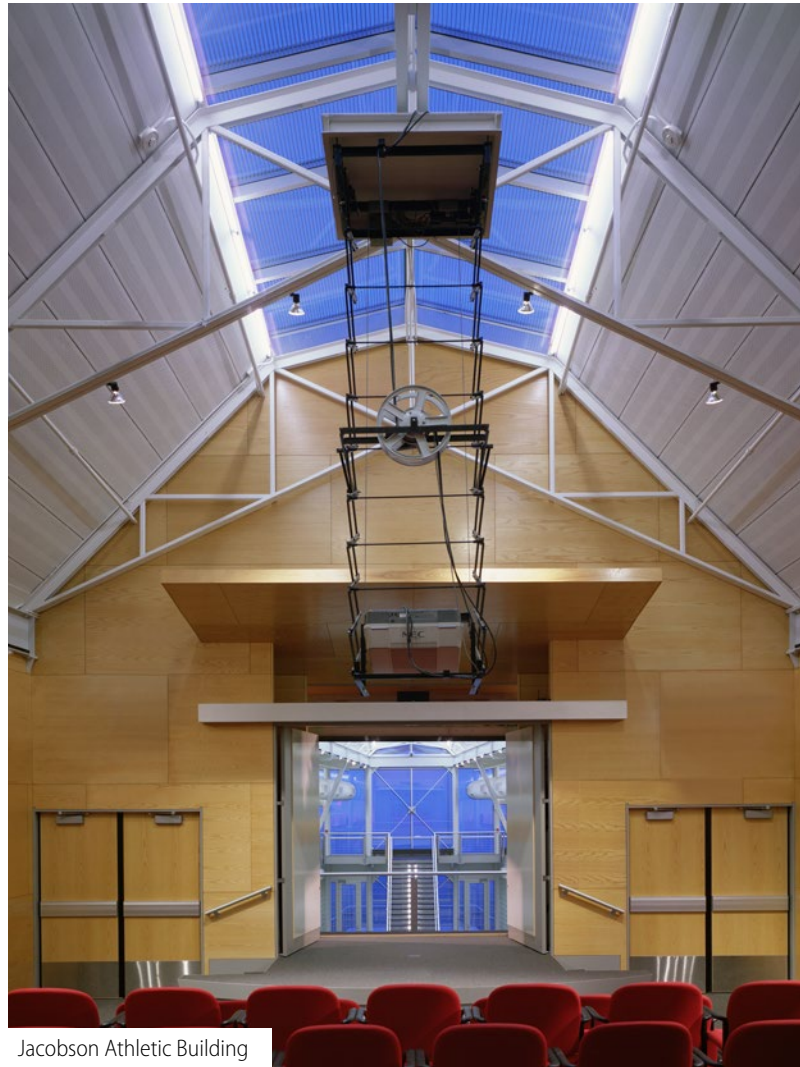
Jacobson Athletic Building

Iowa State's state of the art Jacobson Athletic Building houses all football offices, locker rooms, meeting rooms, strength and conditioning room, and sports medicine room. AWS furnished and installed the windows, curtain walls, aluminum plate panels, sunscreen, skylight and entrances. Skylight panels over the auditorium featured Unicel's Vision Control® power-operated louvers within a sealed glass airspace. The Vision Control® louvers ensure adjustable lighting as required for projector and game film purposes.